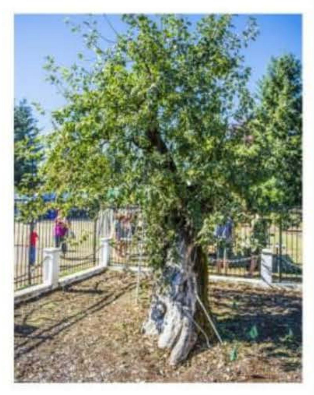
Though the tree's trunk "died" in 2020, a new tree has grown from its original root system.

Washington is the nation's top producer of apples, and at the Old Apple Tree Festival (October 7), you can get a cutting (and start your own tree) from the state's oldest one, planted in 1826 at Fort Vancouver. Urban Forestry provides an explainer on getting your cutting started, and arborists are on hand to demonstrate fruit tree pruning. Not ready for the commitment? Attendees can borrow tools and pick apples from the Fort Vancouver Historic Orchard or bring their own from the grocery store (along with a clean jug) to press into cider on-site with help from nonprofit Urban Abundance.